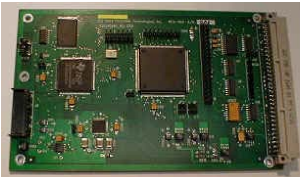
VOCD Printed Circuit Board (PCB)