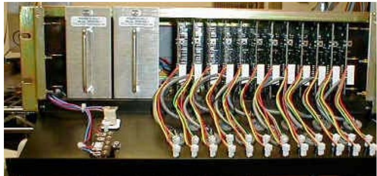
VOCD 12-Channel Chassis